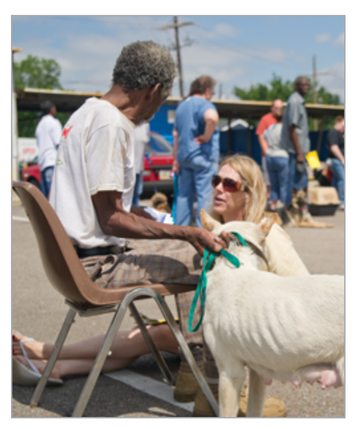
> Dog being signed up for free spay/neuter services after having multiple litters due to the owner's lack of finances and access