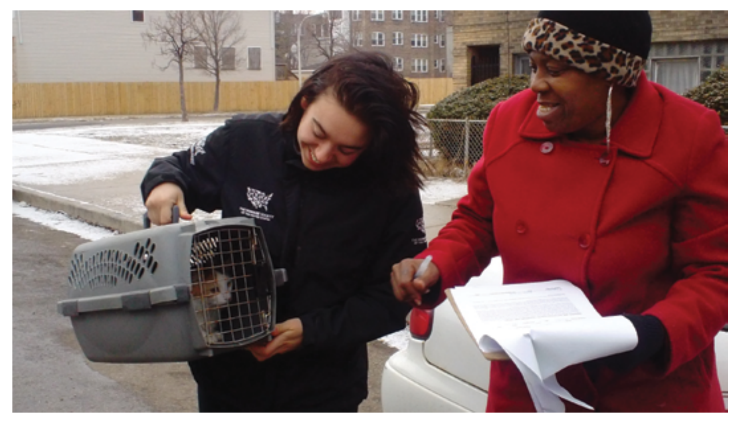
> Volunteers organizing the transport of cats to receive spay/neuter services.

the paperwork from the veterinarian and any followup medications. He/she should go over any pertinent instructions for after-care.