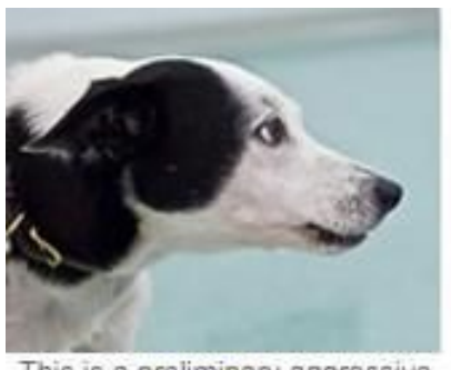
This is a preliminary aggressive threat. The oog's ears are back, she's giving a direct stare and her lips are pulled over her teeth.