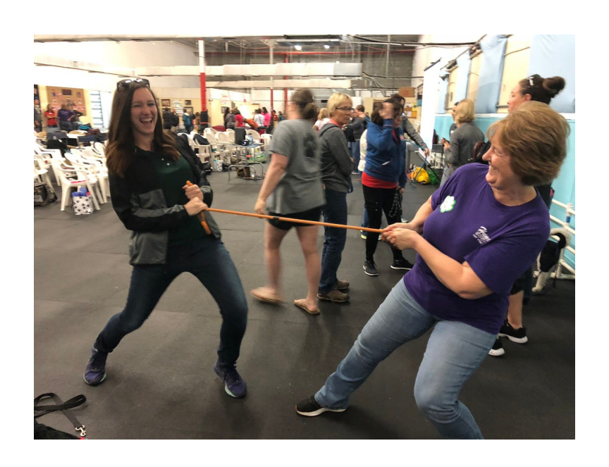
Look at how strong the lock is!