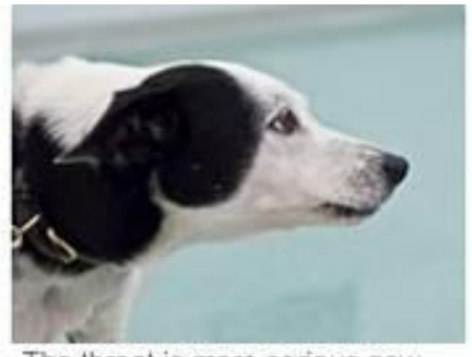
The threat is more serious now. Her muzzle extends forward and she's giving a low growl.