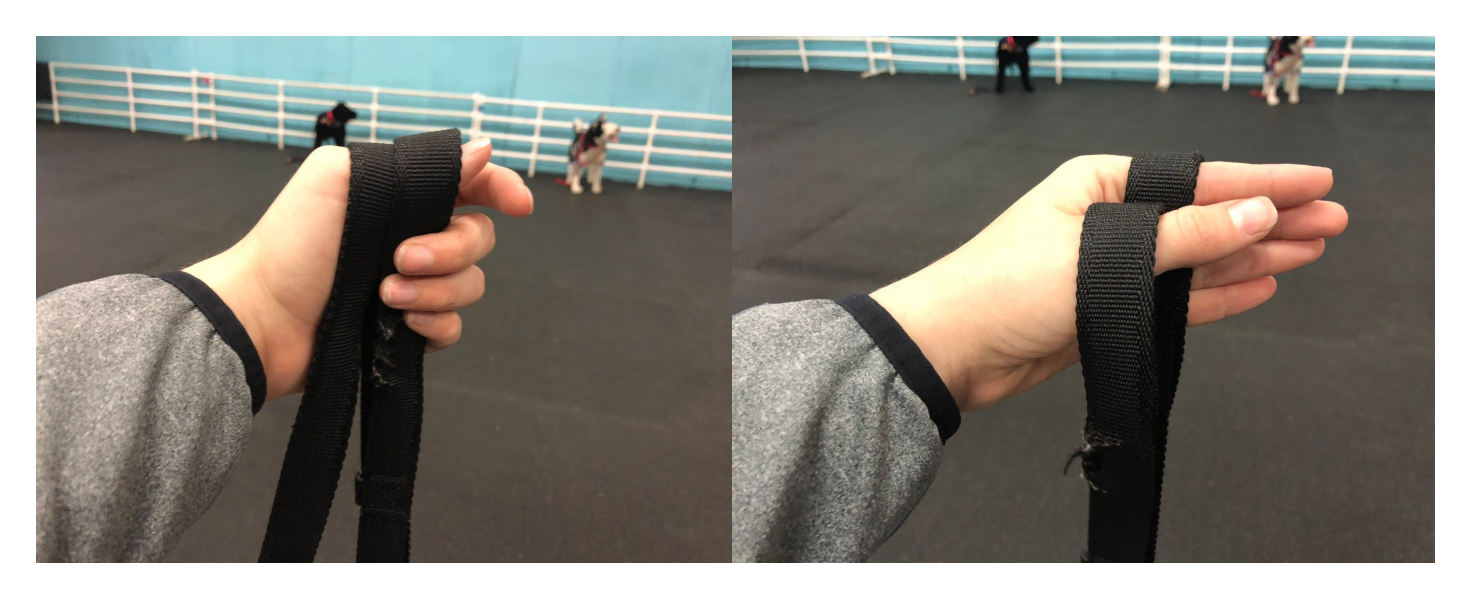
Lock on thumb