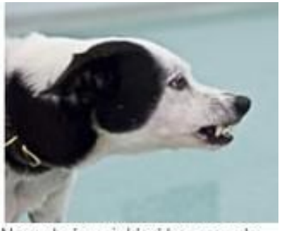
Now she's wrinkled her muzzle to expose her front teeth. She's growling loudly and preparing to lunge forward and attack.